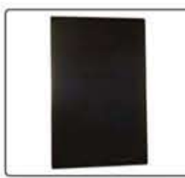
solid black color