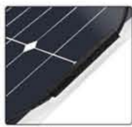
Ip67 Waterproof junction box